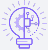
ARKK ARK Innovation ETF